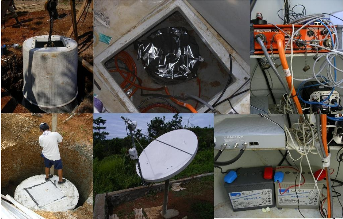
Fig. 2: Installation of GEOFON/GITEWS field station in Indonesia