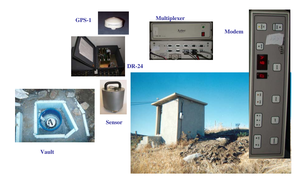
Figure 4. A typical HL outstation. In the present case LIA site.